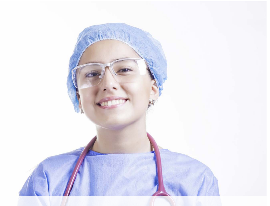
Medical Claims Administrators and Plan Options